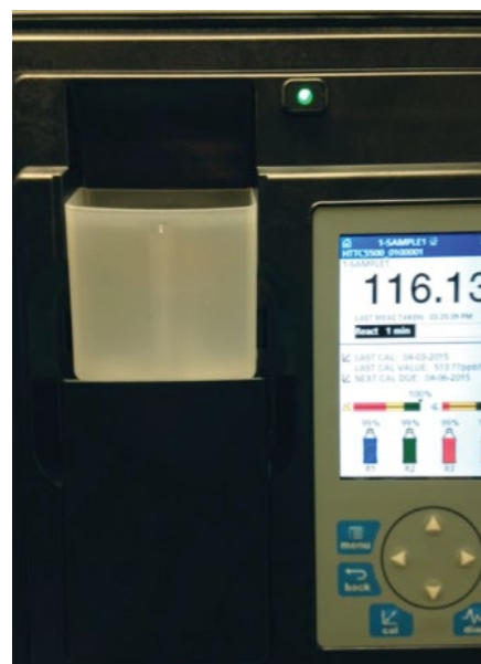
Figure 3 – Grab sample funnel