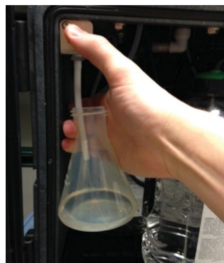
Figure 4 – Grab sample outlet