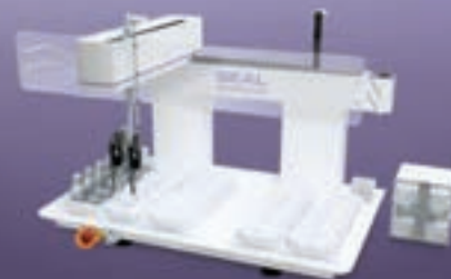
SEAL Minilab 1200

SEAL Robotic Minilab systems for automating sample (pre) treatment in the laboratory — improving your sample handling efficiency. Typical applications include BOD, pH, COD, Alkalinity, and conductivity measurements with options such as decapping/capping, sample splitting, and filtration. Call us about your laboratory needs and we will design a robot to suit you.